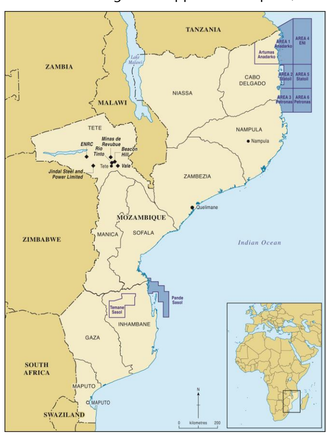
Figure 1: Coal and gas extraction sites in Mozambique

Mozambique is not a historically important minerals producer and did not appear on global mining companies' radar until the past decade. This changed in 2008, when visiting geologists in the central province of Tete (see Figure 1) confirmed that the coal seam beneath Moatize basin is part of the world's largest untapped coal deposit, with over 23 billion metric tonnes of coal—enough to